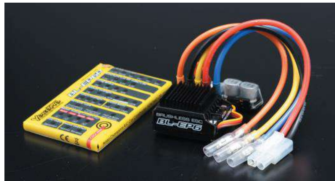
BL-EP6 Brushless ESC(Program card included)