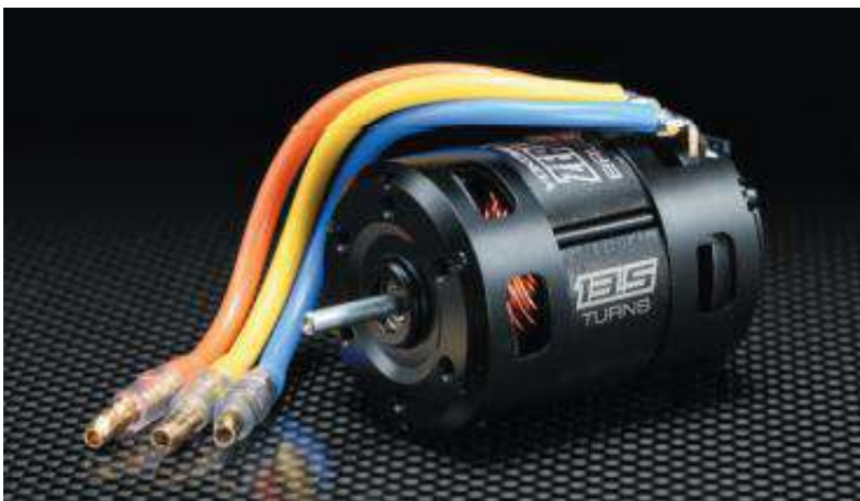
Brushless motor ZERO3 Series