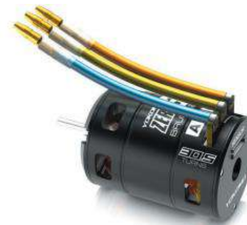
Brushless Motor ZERO-S Series