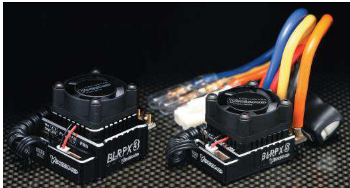
Racing Performer BL-RPX3 RPXS Brushless ESC