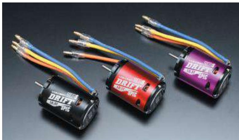
Brushless Motor ZERO-S Drift Series